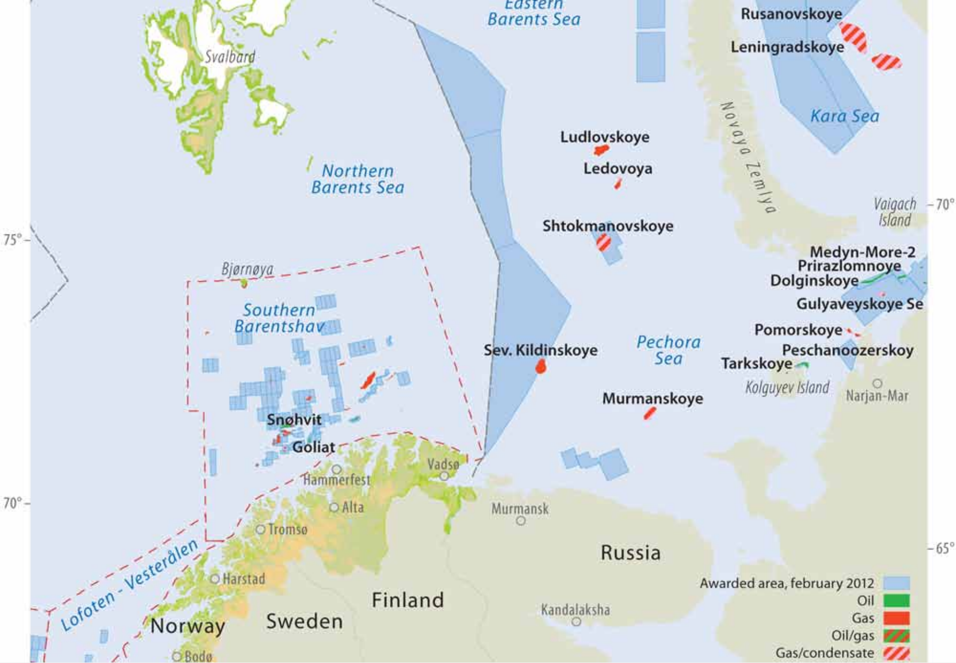
Fig.5.4 - Facts 2012